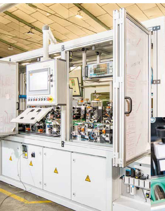
Robot controlled inspection system with ELOTEST PL650, ELO\SCAN and image processing module ELO\IMAGE.

ELOTEST PL650 in combination with the universally applicable SCAN\ALYZER inspection, documentation and analysis software for a quick and safe creation of C-Scans.