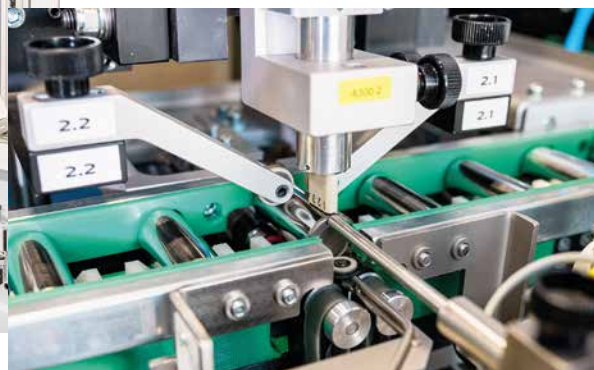
Automated inspection for cracks and grinding burns on rolling elements with the ELOTEST PL650 and probes (Type KD-129 and KDA-129).